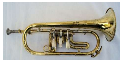
Fort Point Brass